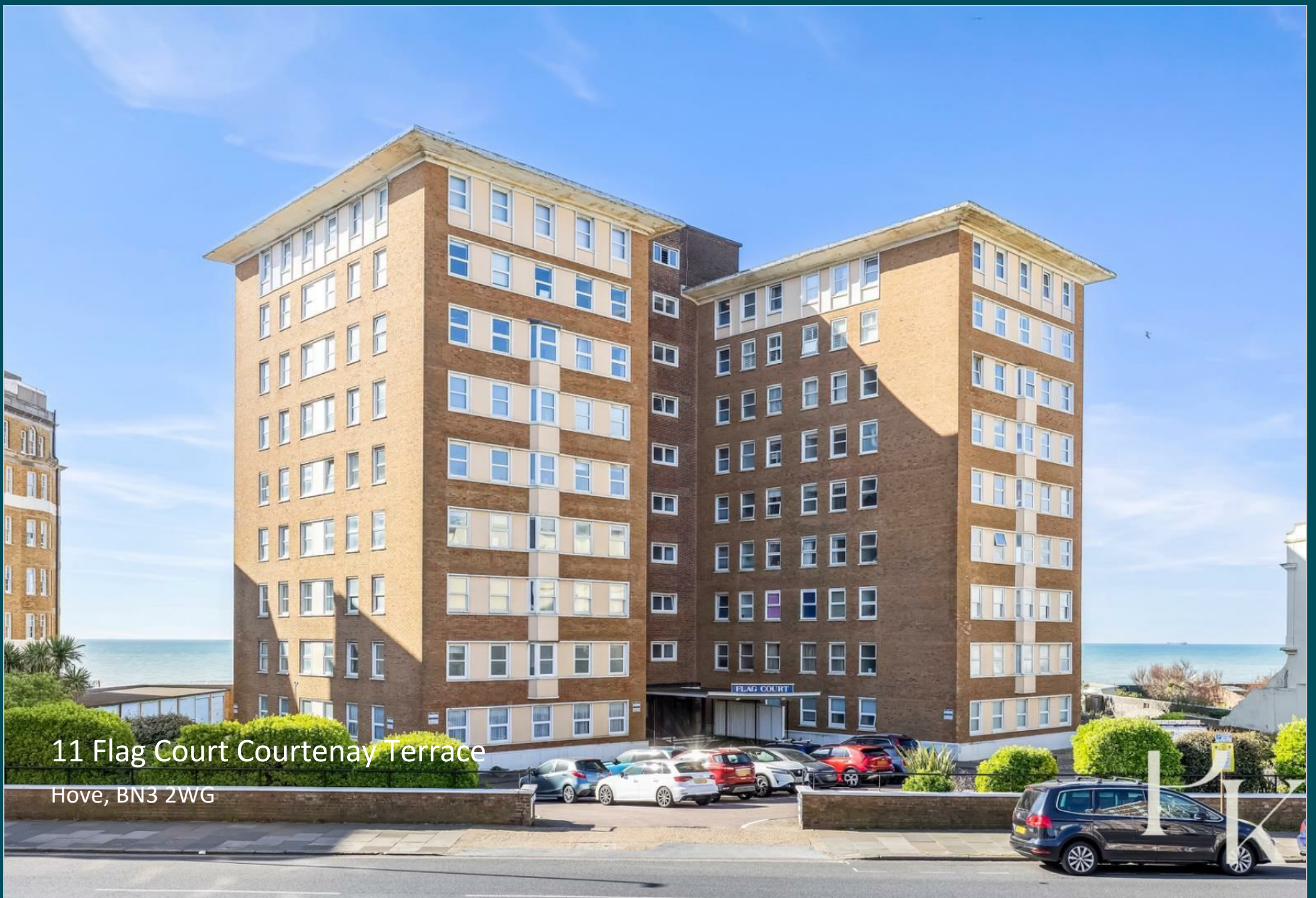
11 Flag Court Courtenay Terrace Hove, BN3 2WG